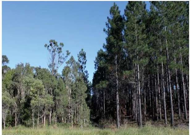
Much of the former extent of RE 12.3.4 in SEQ has been replaced by exotic pine plantations, that grow well on the low fertility soils. Remaining significant patches of RE 12.3.4 are often found along drainage lines within and adjacent to pine plantations.

RE 12.3.4 can be quite variable in appearance, with the proportion of the two distinguishing species varying greatly across the landscape. The top right photo shows a Coastal Paperbark ( Melaleuca quinquenervia ) dominant example, and the bottom right photo shows a Swamp Mahogany ( Eucalyptus robusta ) dominated site.